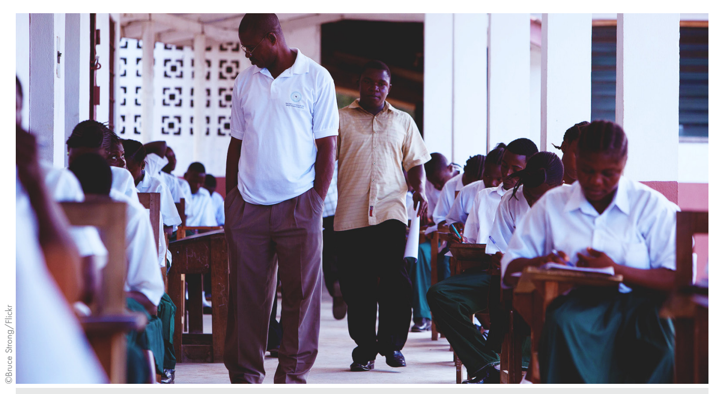
There has been rising interest in the need for 'transferable skills' training to enhance the overall quality of graduates from secondary schools and institutions of higher learning.