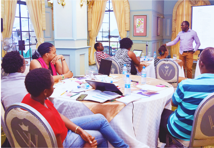
AFIDEP staff at the Strategic Plan review meeting in Nairobi in March 2017.