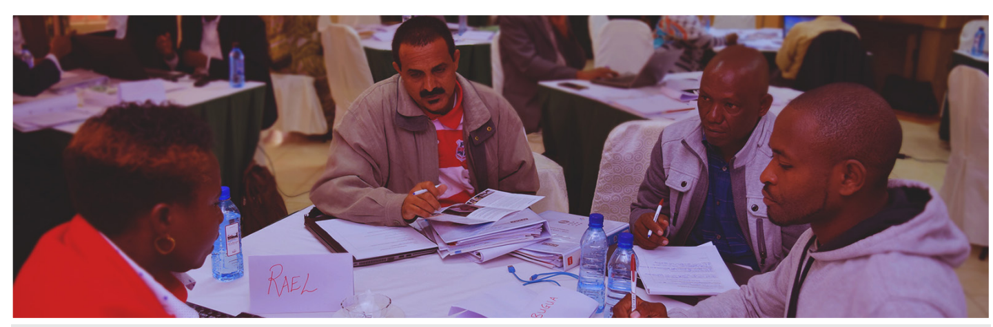
County health representatives hold a discussion during a training session on evidence use for the six Kenyan counties with the highest rates of maternal deaths on 16 June 2017. AFIDEP organised the training to cascade gains made from the SECURE Health programme to the county level.