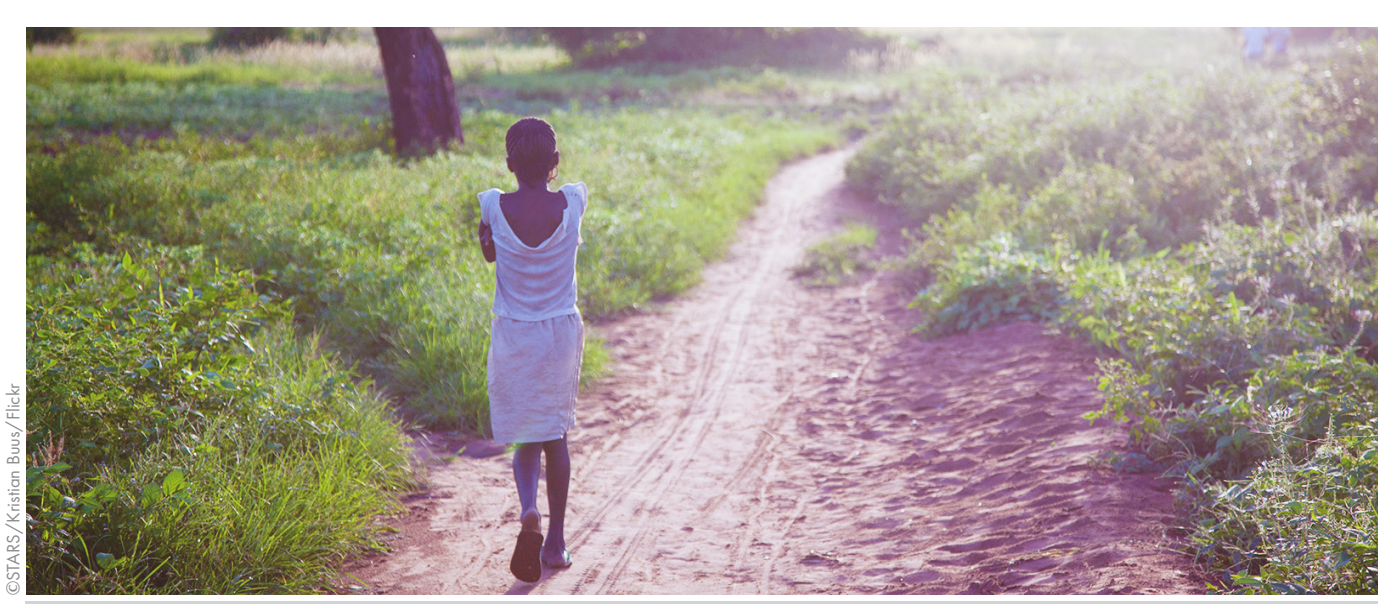
A reduction in early marriage will enable girls to stay in school longer, complete their education, and eventually find or create decent employment, hence contributing to meaningful development of the country.