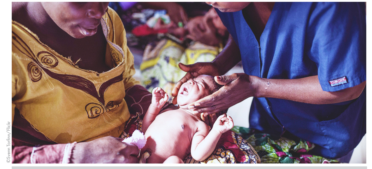
African countries need to have a long-term life-cycle perspective and ensure that children being born today have good health services, nutrition and transformative education throughout the education pipeline

Africa is quite heterogeneous and we should not talk about it as a uniform set of countries. Therefore, policy options for optimising the demographic dividend should be context-specific both from the perspective of socio-economic conditions, but also the stage of the demographic transition where countries are. "Youth bulges" and "working-age bulges" have already been created in the African countries with relatively low fertility, mostly located in southern and northern Africa. These countries have already harnessed some demographic dividend, but not to the same magnitude as achieved by some East Asian and Latin American countries because the fertility decline was relatively slow and not accompanied with huge investments in human capital development and job creation. Since the window of opportunity for harnessing the demographic dividend will remain open for a couple of more decades in these countries, the level of the dividend can be salvaged by enhancing investments in strategic human capital development focused on sectors of comparative advantage and diversifying their economies to absorb the "workingage population bulges" they are already >> Continued on pg. 14