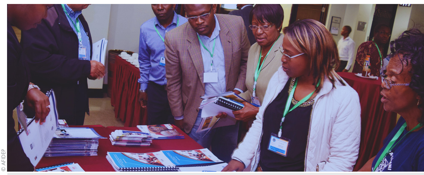
Delegates at the ECSA-HC Best Practices Forum perusing material at the AFIDEP information desk generated from the SECURE Health programme.