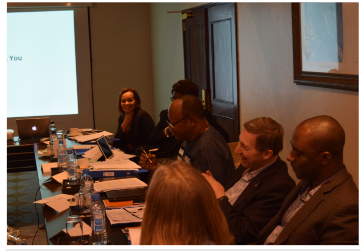
A section of the members of AFIDEP's Board of Directors enjoying a hearty moment during a board meeting in Nairobi in November 2017