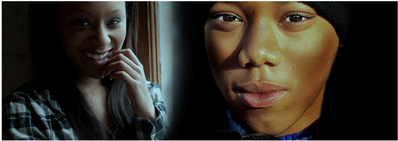
Ensuring that youth have good sexual and reproductive health outcomes is a major determinant as to whether youth achieve their full potential, or not

The Policy stipulates that MoEST shall implement sexuality education, AACSE to be precise, in line with the Education Sector Policy on HIV and AIDS of 2013. Other areas of involvement for MoEST as outlined in the Policy are: facilitating provision of information to parents on the sexual and reproductive health of adolescents within the school set up, and strengthening partnership with the Ministry of Health (MoH) to provide ASRH information and services in schools.