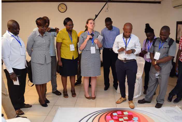
Participants at a workshop on communicating the demographic dividend in Dar es Salaam, Tanzania (4-5 October 2017). The workshop was part of a project seeking to recruit key influencers to communicate and advocate on issues related to one or more of the four pillars of the demographic dividend