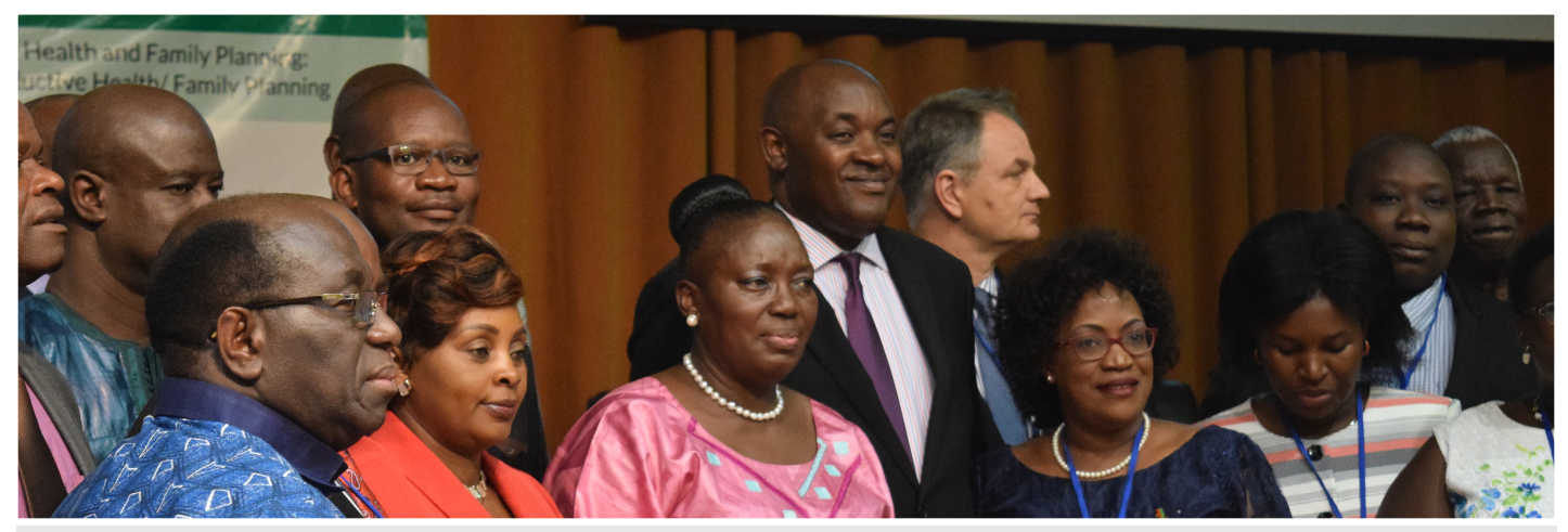
Members of parliamentary committees of health from various African parliaments pose for a photo with the Uganda Speaker of Parliament, Rt. Hon. Rebecca Kadaga (centre) during the opening of the 2017 annual NEAPACOH forum, in Munyonyo, Uganda