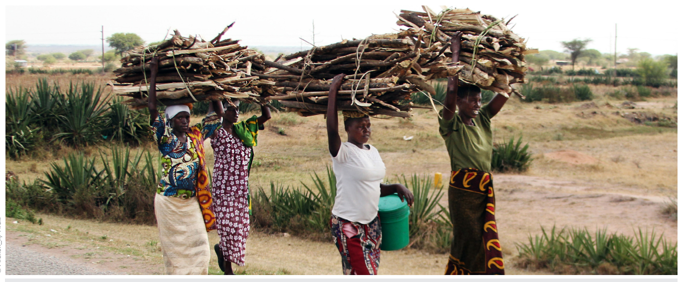
A common thread in the report is that one's gender is an important determinant of experiencing inequalities. Being a girl or a woman intensifies the inequalities that one experiences