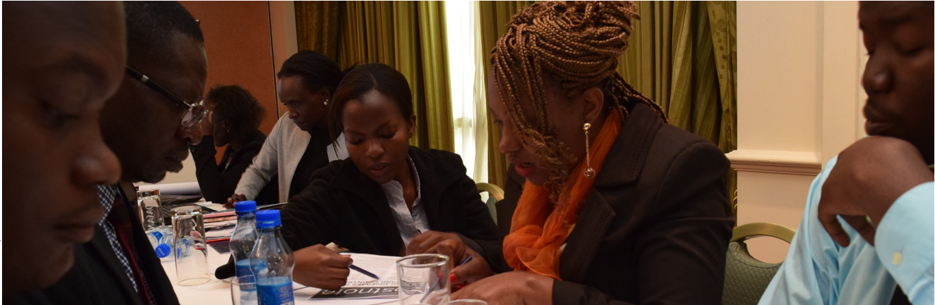
Staff of the Parliamentary Research Service, which provides research support in policy development to the Kenya Parliament, during a past workshop on evidence use in Nairobi

This example demonstrates the importance of technical staff who have the requisite knowledge and skills in improving the performance of parliaments in Africa. As parliaments in Africa continue to implement efforts to improve their performance, we hope that they will prioritise the institutional systems and structures they have put in place to enable access to, and use of, information and technical advice in parliamentary debate and decision-making. Some parliaments, such as Uganda and Kenya, are setting the pace in this area, and it will be great if more African parliaments can follow in the footsteps or even do better.