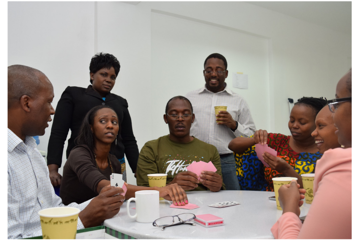
AFIDEP Nairobi members of staff playing a round of cards during a "Happy Hour"-themed staff party in Nairobi - July 2017