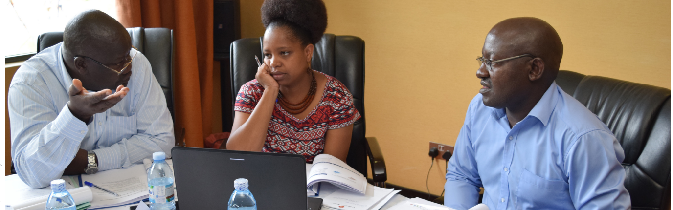
A section of the technical staff from the five African parliaments that participated in the December 2017 AFIDEP training workshop on evidence-informed decision-making (EIDM) in Munyonyo, Uganda.