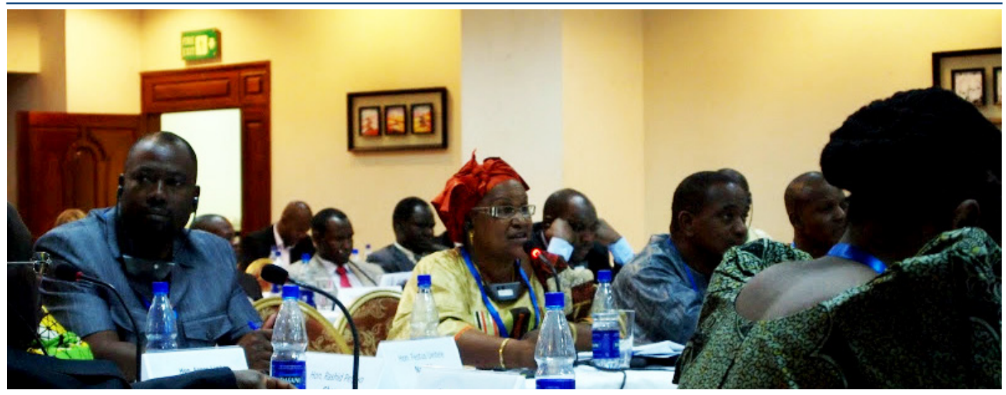
Members of NEAPACOH during a past forum. Set up in 2005, NEAPACOH is an open network for African parliaments, and therefore, any African parliament interested in the network's goals can participate in its activities.

This study used a qualitative case study design, which is widely employed in policy analysis studies. For data collection, the study conducted extensive and critical document review; in-depth interviews with NEAPACOH's leadership (members of the network's Executive Committee), MPs belonging to member health committees, staff and development partners who have participated in NEAPACOH forums (34 interviews conducted); and questionnaire administered to participants of the June 2016 NEAPACOH forum in Uganda.