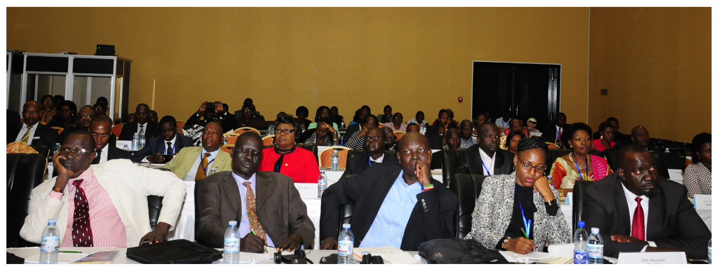
Members of parliamentary committees of health and other stakeholders in health during a past NEAPACOH meeting. The frequent turnover of MPs every four to five years has resulted in lack of continuity of committees in implementing their annual commitments.

As a voluntary network, NEAPACOH lacks an effective mechanism for holding committees to account