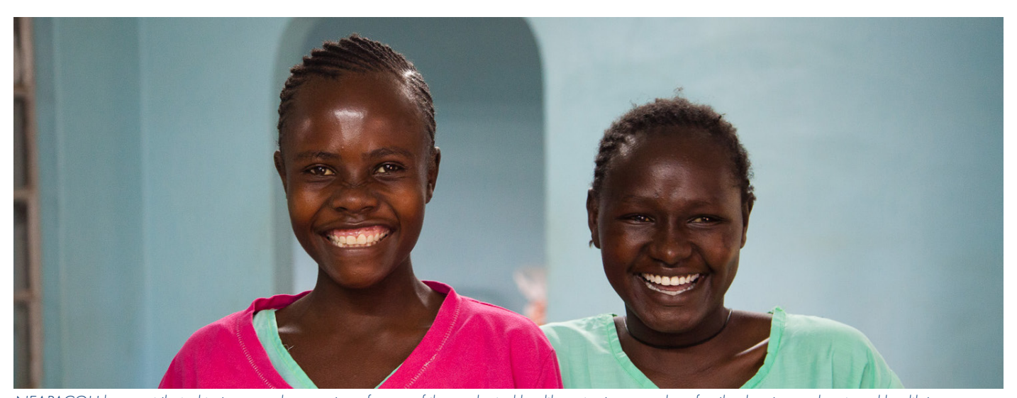
NEAPACOH has contributed to increased resourcing of some of the neglected health sector issues such as family planning and maternal health in some countries. Even then, these issues still receive inadequate budgets in many NEAPACOH member countries, implying that this priority has only been partly met.

For the second priority on effective domestication, implementation and compliance with agreed upon commitments in the health sector by governments, we assessed this by looking at the extent to which member countries had achieved the Abuja Declaration on allocating at least 15% of national budgets to the health sector since this has been a recurring theme at NEAPACOH forums since 2008. Results showed that while some member countries had made progress (Malawi, Mozambique, Namibia, and Tanzania) others had not (Ethiopia, Gambia, Ghana, Kenya, Lesotho, Swaziland, Uganda, and Zambia). While this evidence means that NEAPACOH has been partly successful in achieving its second priority, it is important to caution that the progress made by member countries may have been stimulated by other factors or actors other than NEAPACOH.